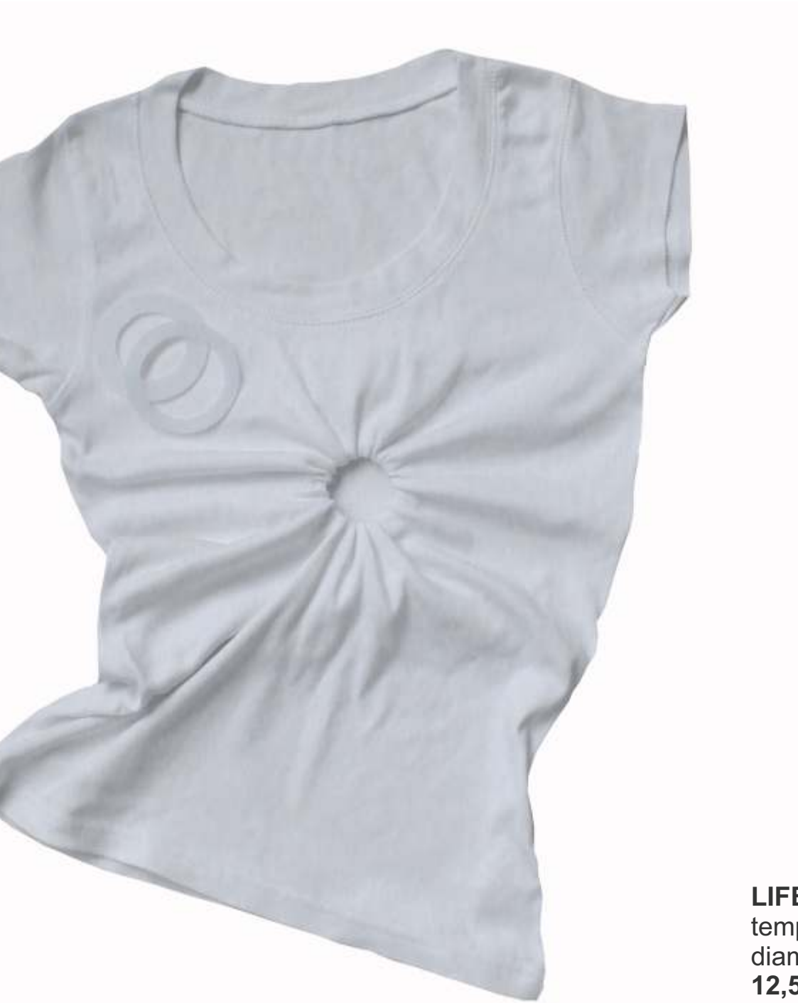
LIFE IS COOL temporary textile transformer diameter 0.6" | 4 cm 12,50 euro